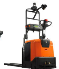
Automated Trucks Horizontal / Transport / Reach / Stack Radio Shuttle / Auto Pilot