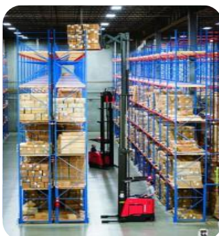
Double Deep Pallet Racking