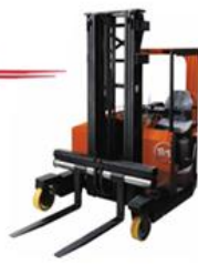
Reach Truck Up to 3 Ton / 12.5m lift height Indoor / Outdoor / Pentograph / Side loader