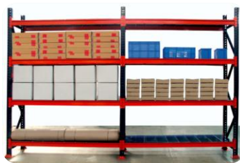
Long Span Shelving