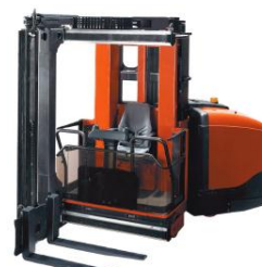
Very Narrow Aisle Trucks Up to 1.5 Ton / 14.8m lift height Articulated – Patented for VCE150A