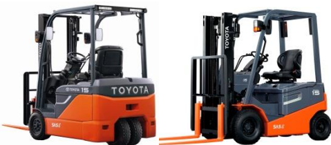
Electric Counterbalance Truck 3 Wheel – Up to 2 Ton / 6m lift height 4 Wheel – Up to 8.5 Ton / 5m lift height