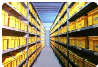
Slotted Angle Shelving