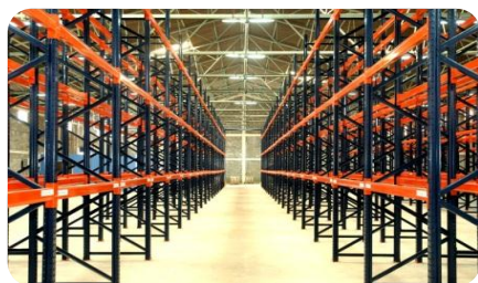
Selective Pallet Racking