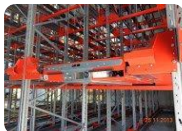
Shuttle Pallet Racking