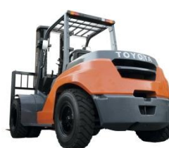
IC Counterbalance Truck Petrol / Diesel / LPG Convertible Type Up to 24 Ton