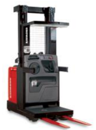
Order Picker Up to 2.5 Ton / 12m pick height Low / Medium & High Level