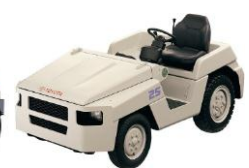
Towing Tractors Electric / Diesel / Petrol Powered