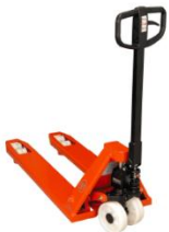
Hand Pallet Truck Up to 3 Ton Low / High / Quick Lift