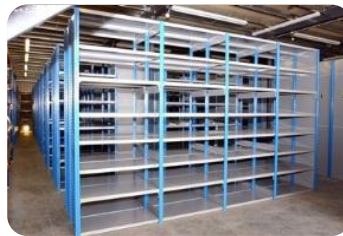
Bolt Free Shelving