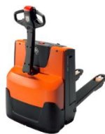
Powered Pallet Truck Up to 3 Ton Walk behind / Ride-on Type