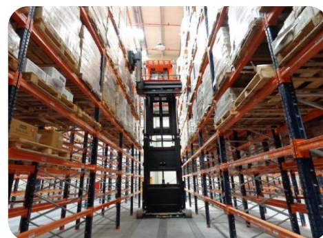
Very Narrow Aisle Pallet Racking